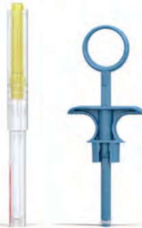
1 BOX OF 100 STERILE NEEDLES + 1 STERILISABLE HANDLE