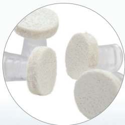
Felt wheels: Great for post-bleaching

Solid felt wheels impregnated with ultra-fine dehydrated polishing paste, activated with a few drops of water, provide excellent polishing and natural shine on all surfaces. Comes with snap-on mandrel system.